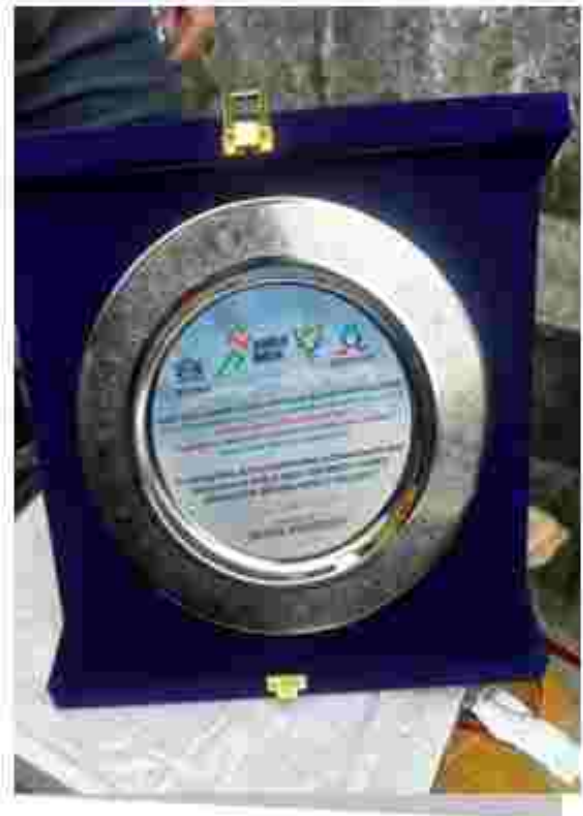
Photo Plate 2: Celebrating excellence in sports! Sikkim University is proud to award these mementoes to our talented athletes