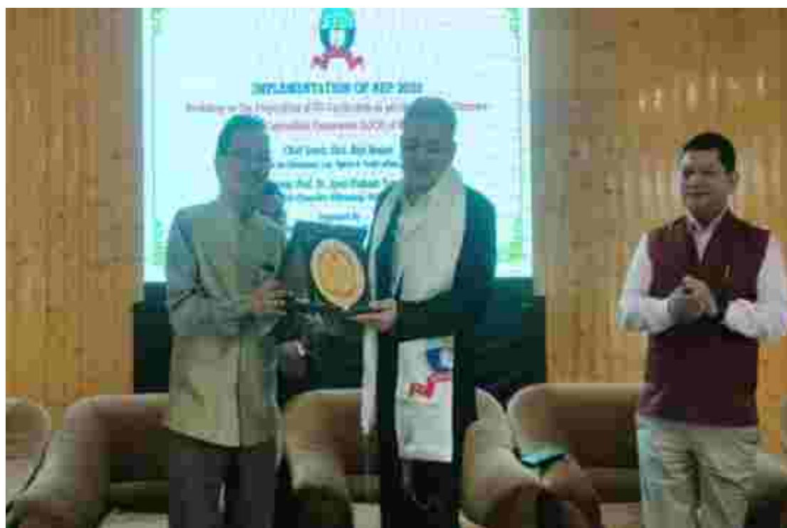
Workshop on Preparation of UG Curriculum