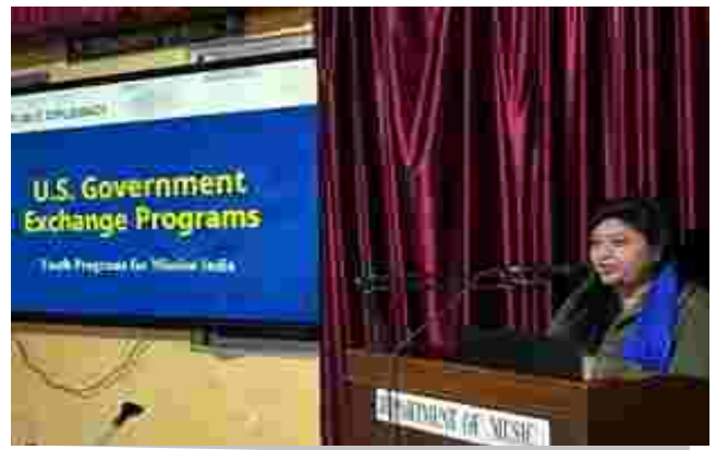
U.S. Government Exchange Program