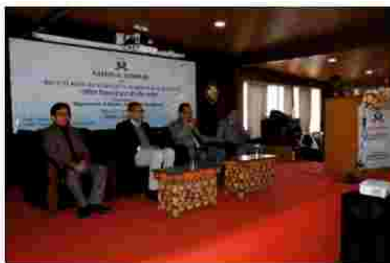
Fig. National Seminar organized by Department of Botany, Sikkim University on "Recent Research Advances in Biological Sciences" held on 7/3-2025.