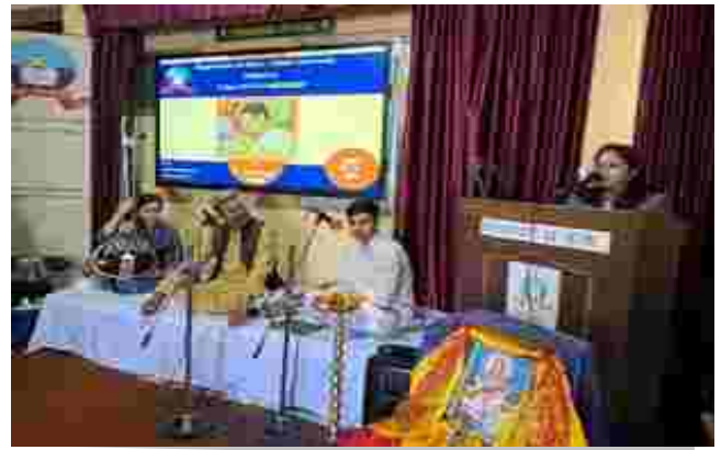
Flute Workshop, SPIC MACAY