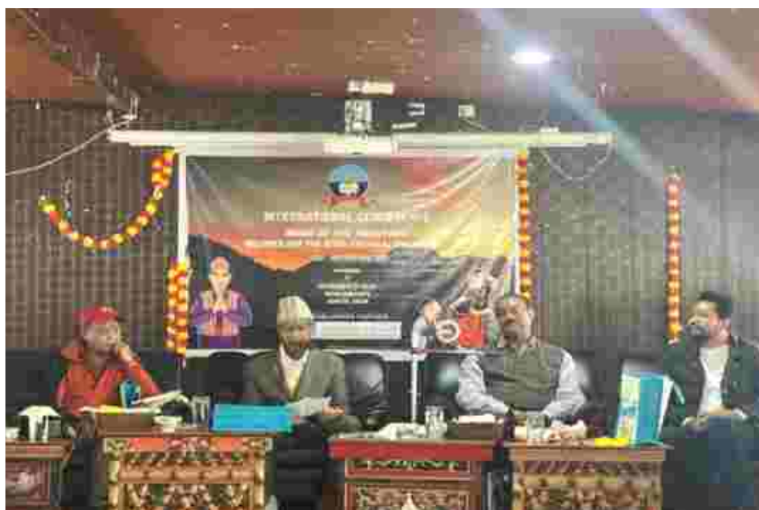
International Conference on "Music of the Mountains" organised by the Dept. of Music.