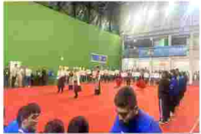
Photo Plate 5: Embracing our roots while celebrating athletic excellence! Sikkim University shines at the Khelo India University Games