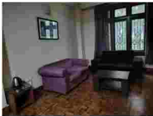
Room at the University Guest House