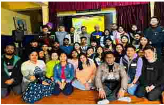
Indian Knowledge System