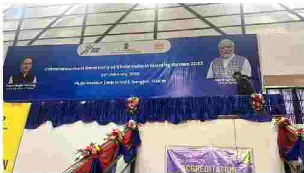
Photo Plate 8: Empowering the youth through sports! Honoring the Chief Minister of Sikkim and the Prime Minister at the Khelo India University Games