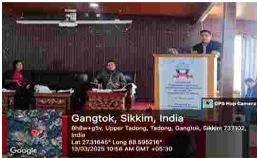
Colloquium on Discussion and Deliberations on Draft NCTE (Recognition Norms and Procedure) Regulations, 2025 in alignment with the NEP 2020