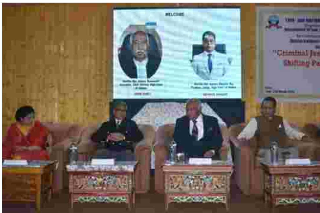
Two Day National Conference on "Criminal Justice in India: Shifting Paradigms", organised by Department of Law, Sikkim University in collaboration with Sikkim National Law University.