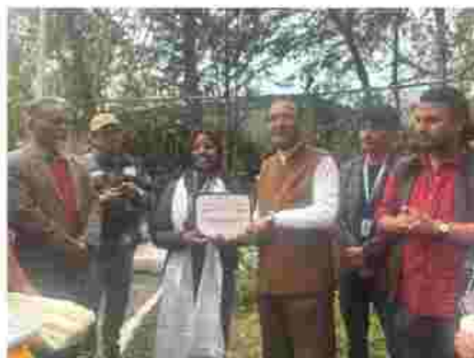
Plate 2: Felicitation by Hon'ble Vice Chancellor, Sikkim University