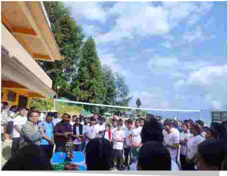
Photo 2: The Vice-Chancellor inspiring participants at the Sikkim University Marathon 2024