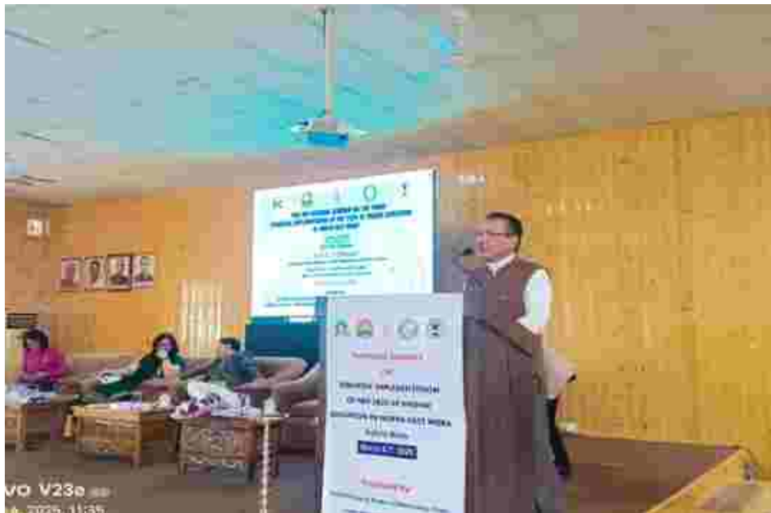
Two Day National Seminar on Strategic Implementation of NEP 2020 at Higher Education in North East India