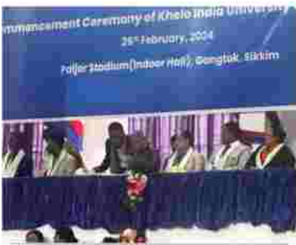
Photo Plate 6: Hon'ble Education Minister, Govt. of Sikkim and Vice Chancellor, Sikkim University, Khelo India University Games