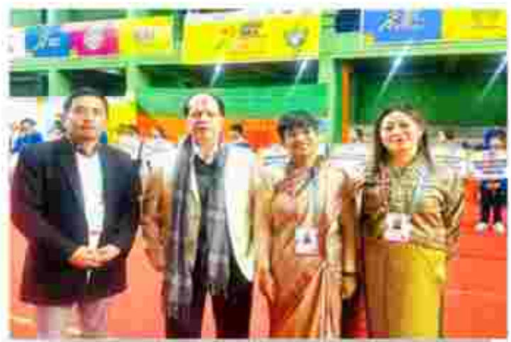
Photo Plate 7: Pushing boundaries and achieving greatness! Meet Sikkim University's proud representatives at the Khelo India University Games in the Khelo India University Games