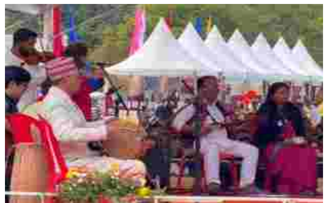
Faculty and students from Department of music performing at the Youth Conclave organized by Department of Tourism, Sikkim University at Yang Yang Campus