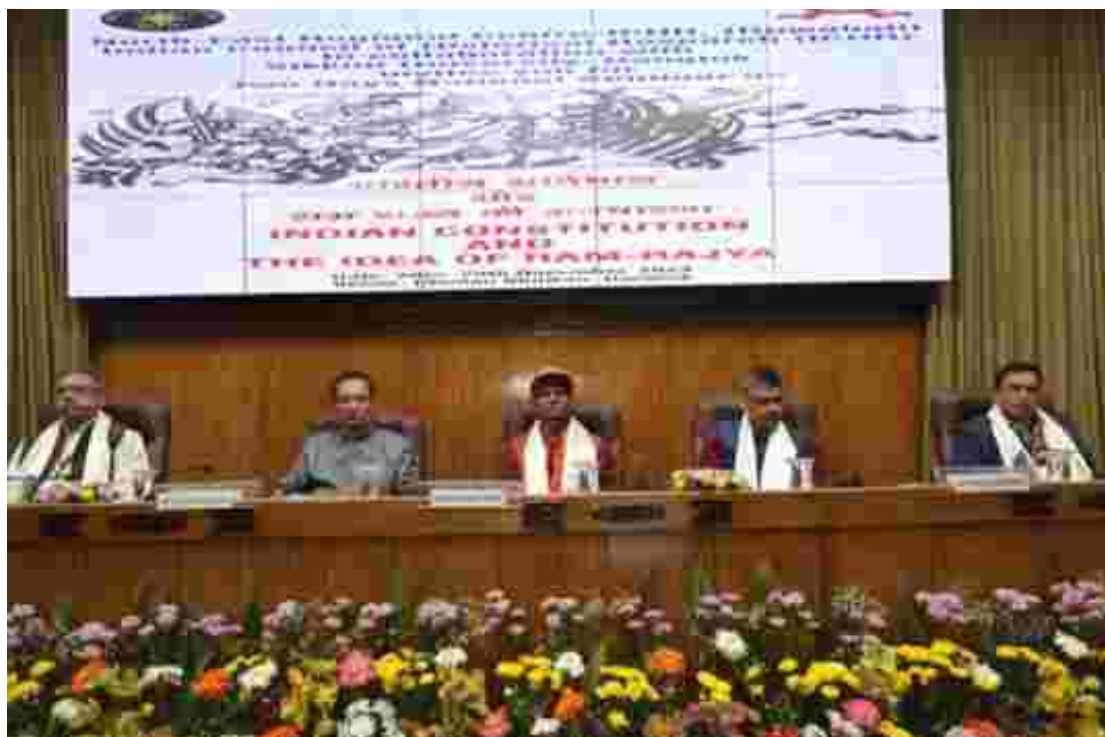
Two Days National Seminar on Indian Constitution and The Idea of Ram Rajya