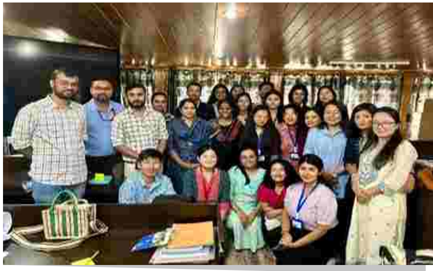
Workshop on Designing Educational Resources