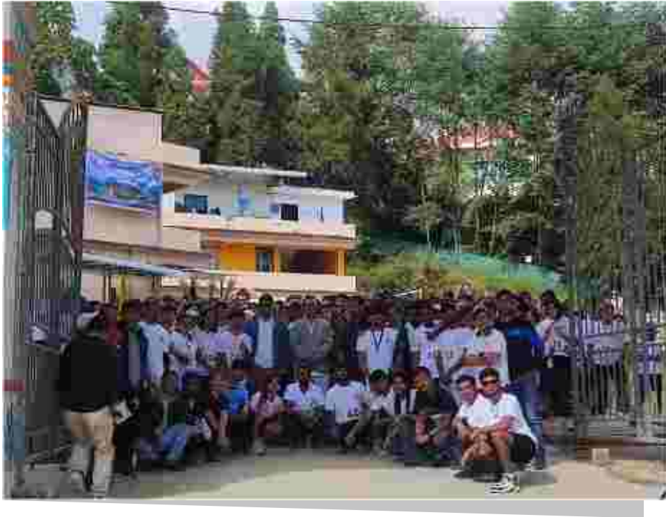
Photo 1: Marathon participants proudly pose with the Vice-Chancellor