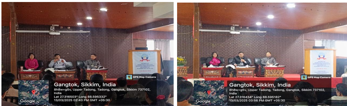
Deliberation on Master of Education (M.Ed.) Program

In the discussion round, faculty members sought clarifications on admission criteria and credit system in the revised M.Ed. framework.