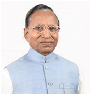
THE CHIEF RECTOR Shri Ganga Prasad Hon'ble Governor of Sikkim