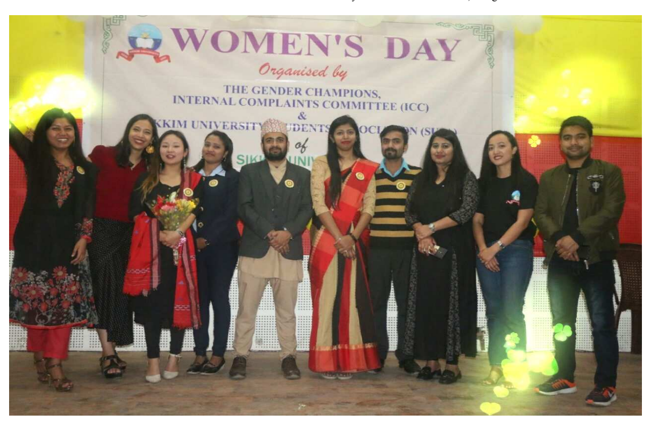
Winners of Gender Champions organized by Internal Complaint Committee in association with Nodal Teachers and SUSA, on the occasion of International Women's Day on 8<sup>th</sup> March, 2018