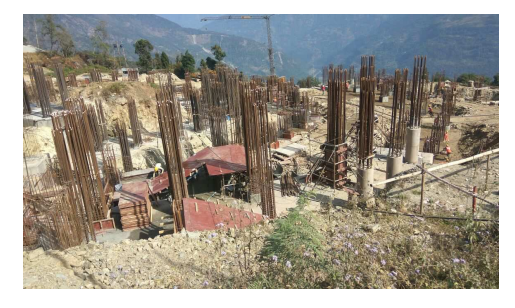
Construction of Library Building at Yangang in progress.