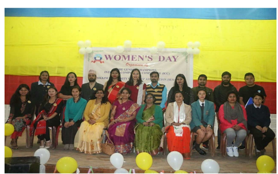
Team of Nodal Teachers, Gender Champions & SUSA Representatives along with Women Achievers on Women's Day celebration on 8<sup>th</sup> March 2018

Sikkim University is committed to providing a congenial environment for work and study, free of sexual harassment, intimidation, discrimination or exploitation of any kind. It is expected of every student and employee of the University to treat others with courtesy and respect. It ensures maintenance of a congenial atmosphere in the campus. In pursuance of the Sexual Harassment of Women at Workplace (Prevention, Prohibition and Redressal) Act, 2013 an eleven member Committee called "Internal Complaints Committee" has been constituted in May 2015 to act as Inquiry Authority on a complaint of sexual harassment. Any aggrieved woman may file a complaint of sexual harassment to the ICC.