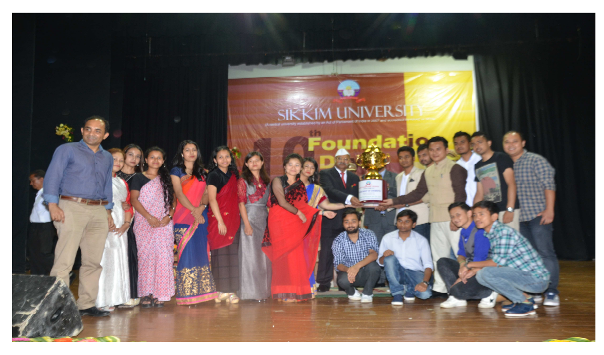
Students & Faculty members of the Department of Chemistry with the Trophy of 'Best Department' on 10^{th} Foundation Day on 2^{nd} July 2017.

The image part with relationship ID rId60 was not found in the file.