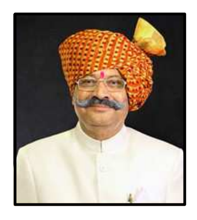
THE CHIEF RECTOR Shri Sriniwas Dadasaheb Patil Hon'ble Governor of Sikkim