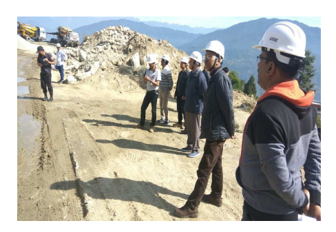
Site visit by the Campus Monitoring Committee

Simultaneously with the planning of a world-class infrastructure, the University has been focusing on teaching and research activities in a big way. The revision of the undergraduate and postgraduate syllabi is undertaken from time to time. The University is facilitating its young faculty members to go for Refresher and Orientation courses in other universities and participating in various seminars in India. The University also invites a large number of specialists from various parts of India to teach and train the students in special areas of knowledge besides sending the students for study tours, fieldworks and internships to various parts of the country.