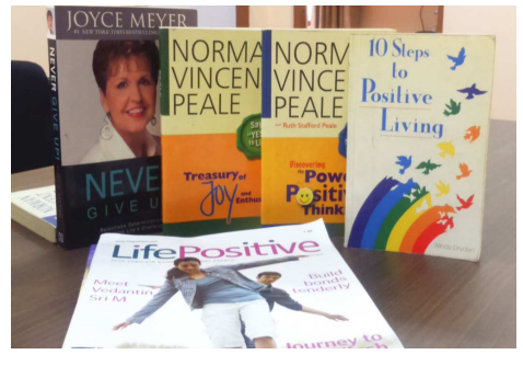
Study materials on "Positive Living" at 'Samadhan' centre.

of hazardous substances, temperamental problems, home sickness, career anxiety, low selfesteem and many other problems affecting personal, academic and social functioning of the students.