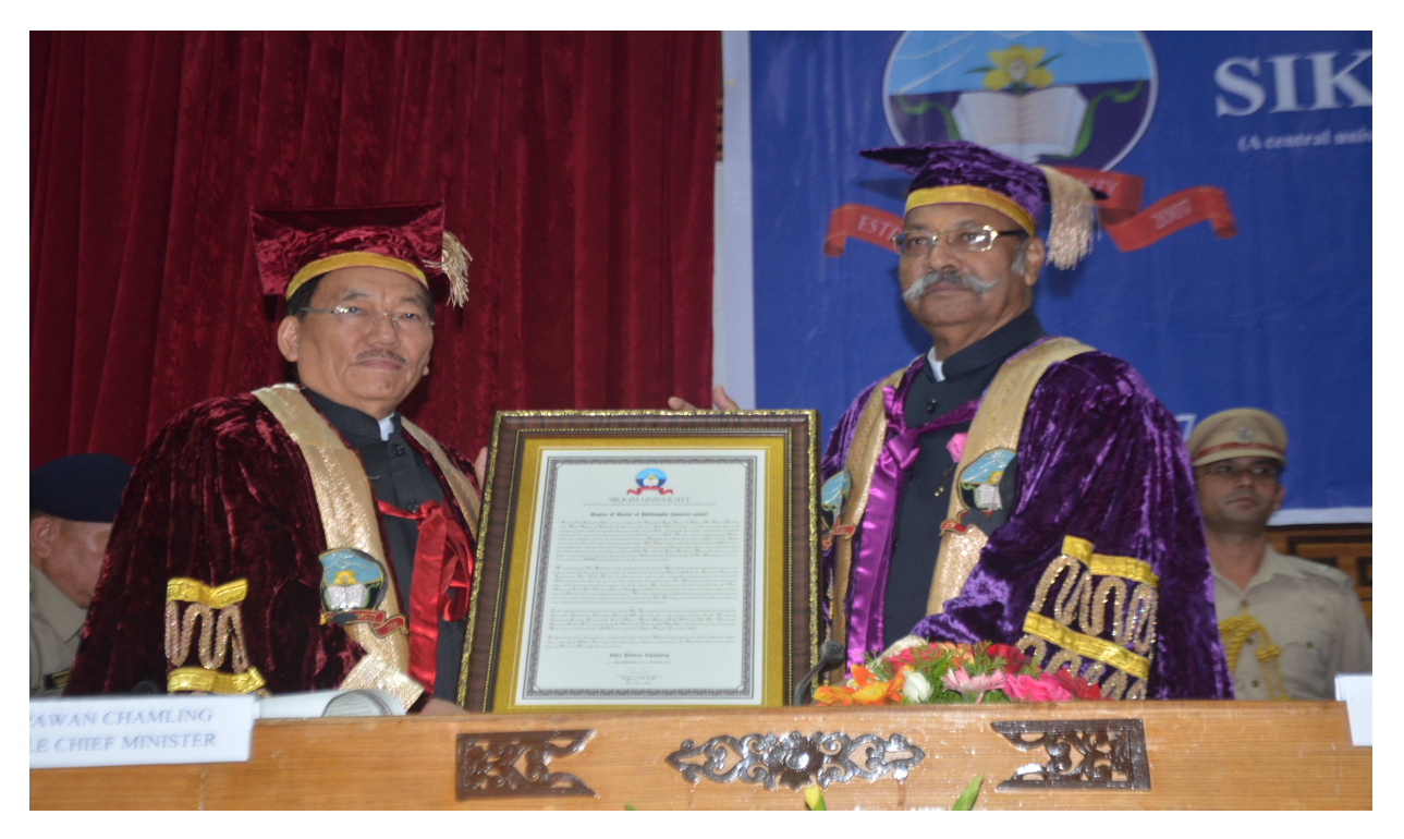
Shri Pawan Kumar Chamling, Hon'ble Chief Minister of Sikkim is being honored with 'Honoris Causa' by Hon'ble Governor and Rector, Shri Sriniwas Patil on 4^{th} Convocation held on 22^{nd} July 2017 at Chintan Bhawan, Gangtok