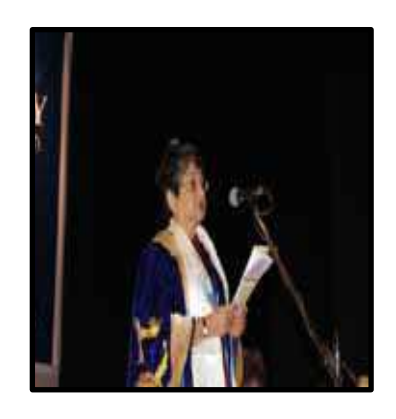
THE CHANCELLOR Justice (Mrs.) Ruma Pal Former Judge, Supreme Court of India