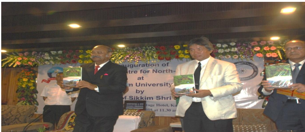
Book release by Chief Rector & Hon'ble Governor of Sikkim on the occasion of Inauguration of Maulana Azad Centre for North East Studies, Sikkim University.