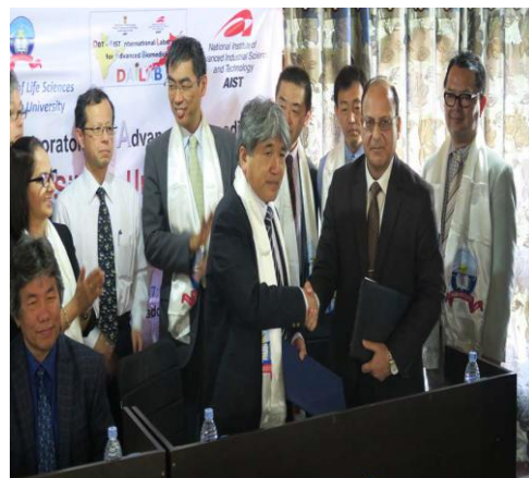
Inauguration of SISTER-DAILAB @ Sikkim University, India, October 26, 2016.