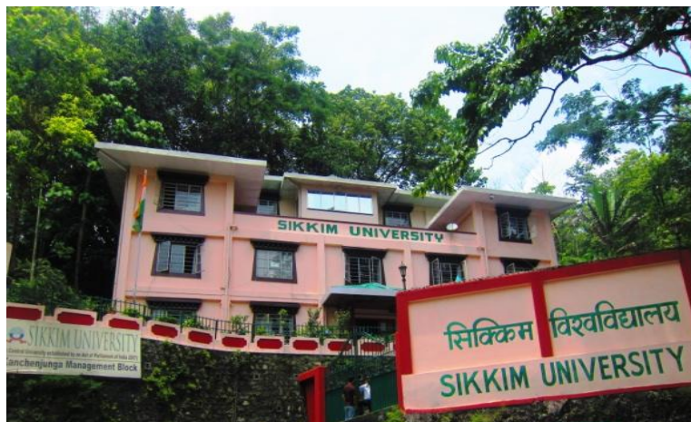
Main Administrative Building

6th Mile, Samdur, PO. Tadong, Gangtok, Sikkim, 737 102.