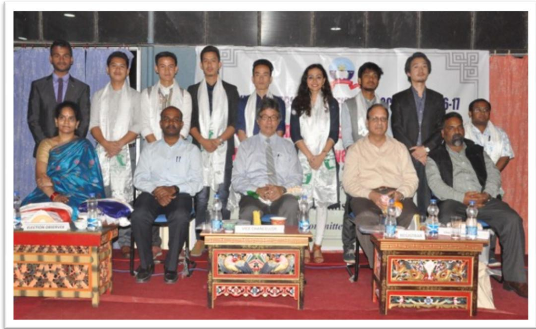
Office bearer of the First Sikkim University Students' Association (SUSA) with the Vice-Chancellor and other officials