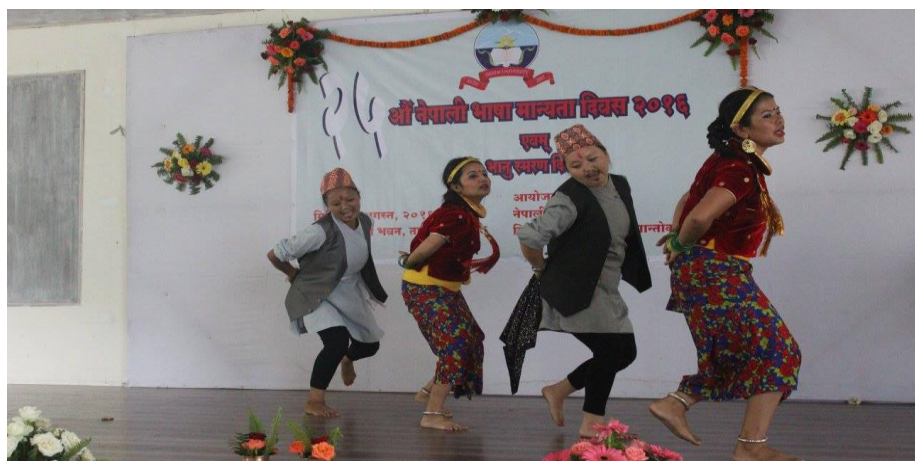
Students' celebrating on the occasion of 'Bhasa Diwas' organized by Department of Nepali.