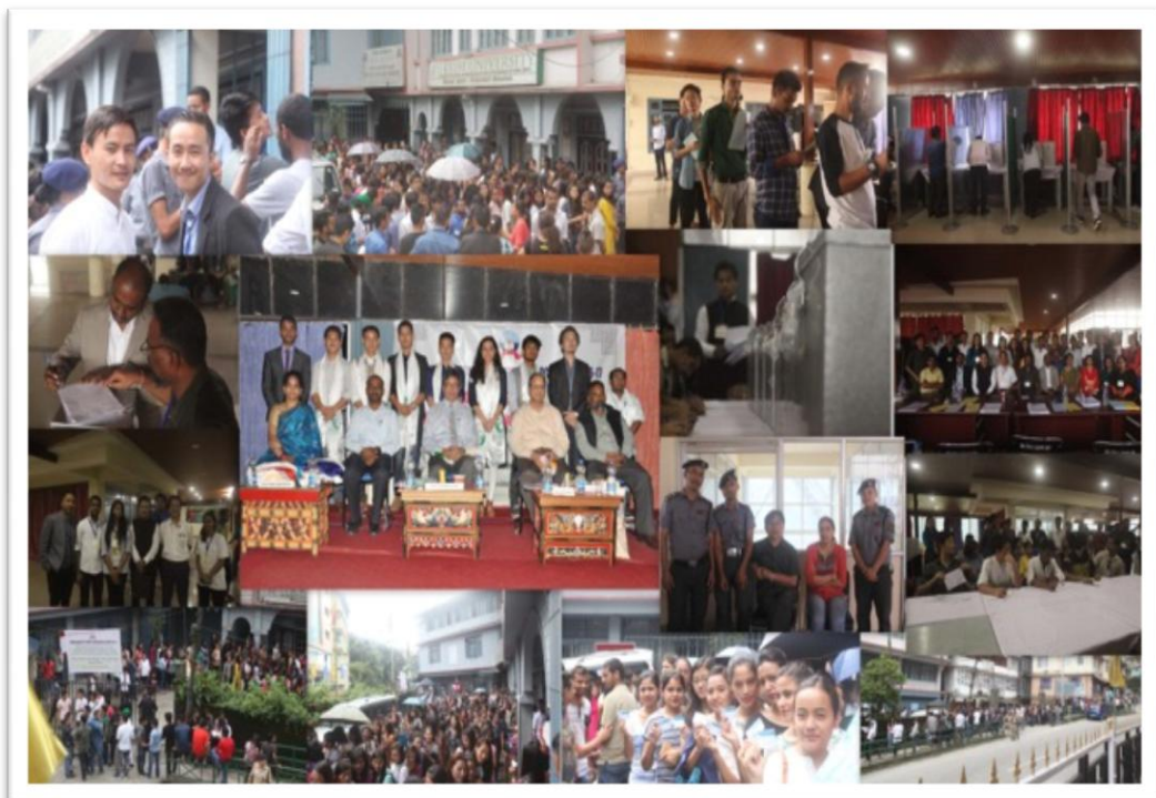
Views of first SUSA election held on 23 rd September 2016