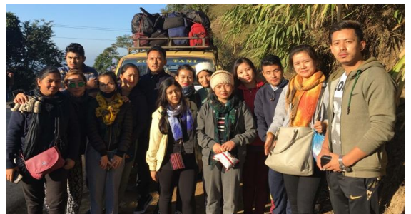
Students of Department of Anthropology during field work at Manipur- Mynmar border December 2016-January 2017