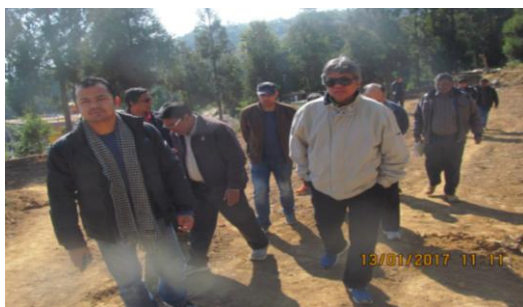
Site visit of the campus construction work at Yangang by the Campus Monitoring Committee

Simultaneously with the planning of a world-class infrastructure, the University has been focusing on teaching and research activities in a big way. The revision of the undergraduate and postgraduate syllabi is undertaken from time to time. The University is facilitating its young faculty members to go for Refresher and Orientation courses in other universities and participating in various seminars in India. The University also invites a large number of specialists from various parts of India to teach and train the students in special areas of knowledge besides sending the students for study tours, fieldworks and internships to various parts of the country.