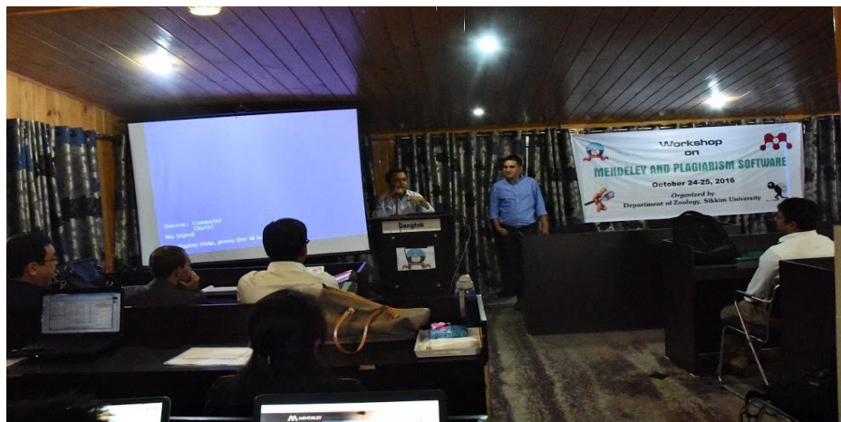
Workshop on Mendeley and Plagiarism Software organized by Department of Zoology, (24-25 October, 2016)