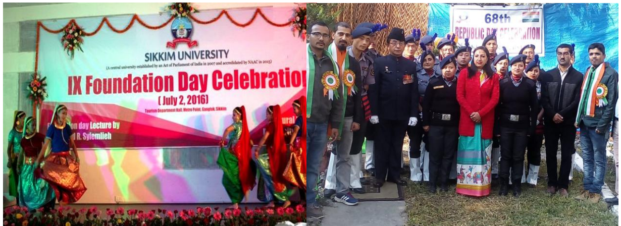
Students performing cultural programme on IX Foundation Day 2016