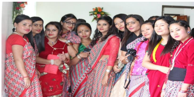
Celebration of Bhasa Diwas by the Department of Nepali