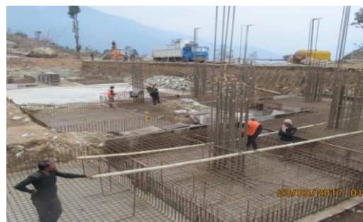
Construction of Library Building at Yangang