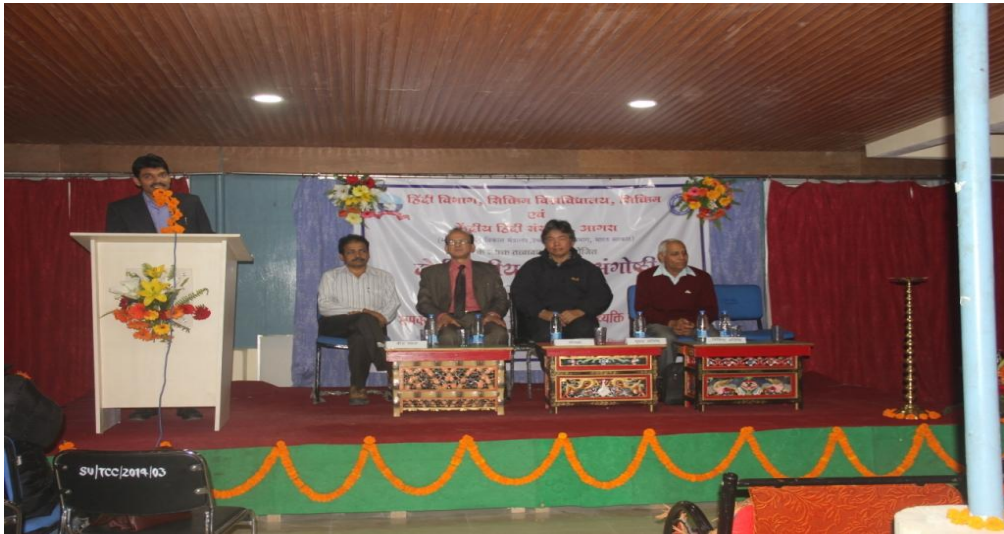
National Seminar organized by the Department of Hindi.