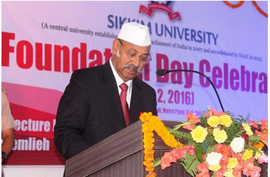
Address by the Chief Guest, Hon'ble Governor of Sikkim & Chief Rector, on IX Foundation Day