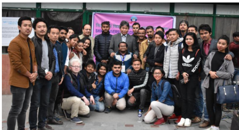
Social Service Events @ Ramailo SU-Khim 2017 organized by SUSA March 2017

Sikkim University Students' Association (SUSA) is constituted on 3 rd October 2016 following the election held on 23 rd September 2016. The official website of SUSA is www.sikkimuniversitystudentsassociation.in . The Vice-Chancellor is the Patron of the Association. SUSA is formed with an idea to foster bonds of harmony and peace among students' community and addresses issues pertaining to students. It also organizes various academic and co-curricular activities round the year.