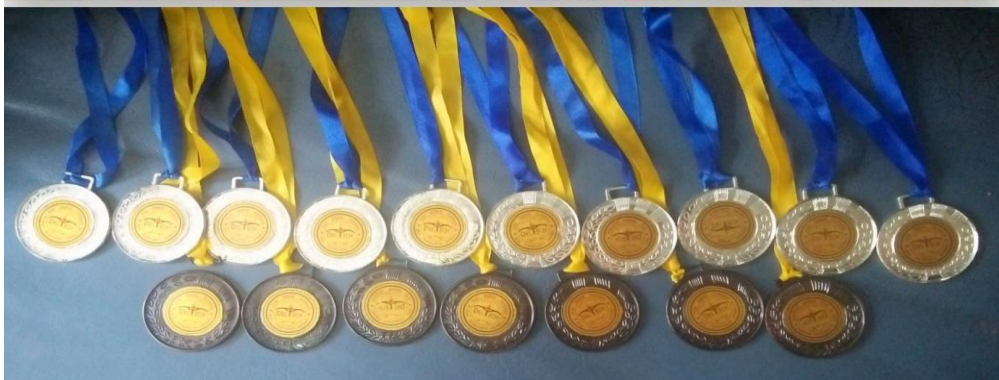
SIKKIM University Sports Team at Delhi won 10 medals in March 2017