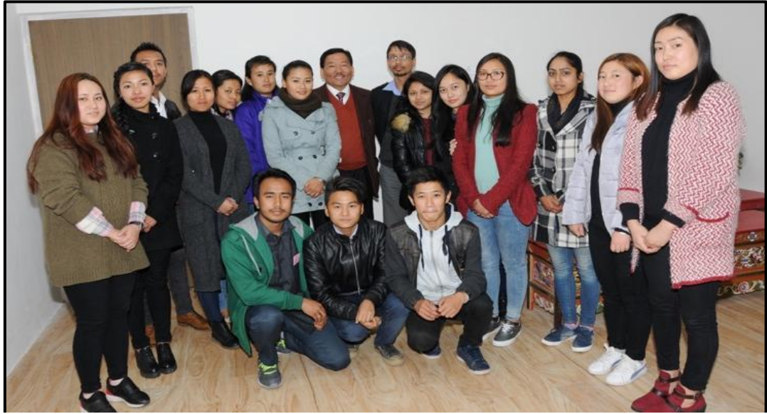
4th Semester Students of Department of Political Science with the Hon'ble Chief Minister of Sikkim at Legislative Assembly on 17.03.2017