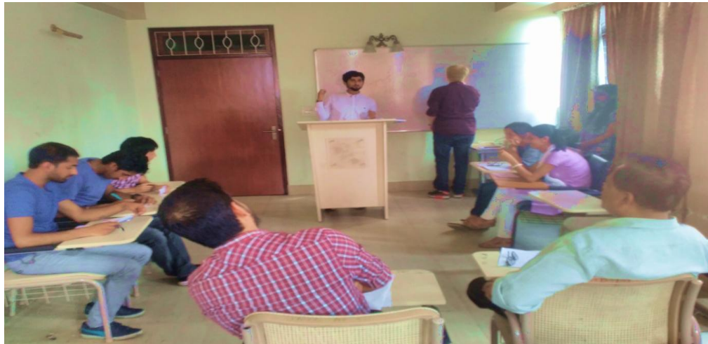
Debate competition at Department of Commerce on Swachhha Bharat Pakhwada.