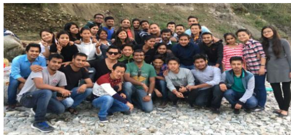
Department of Chemistry, Departmental Picnic 2016