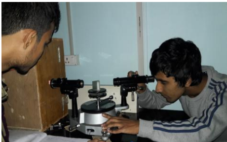
Students in Physics Laboratory