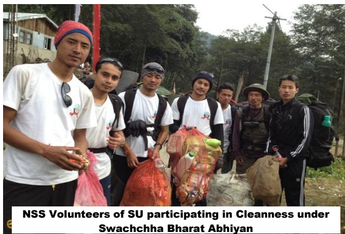
NSS Volunteers of SU participating in Cleanness under Swachchha Bharat Abhiyan

The NSS organizes regular activities and programmes throughout the year in the form of orientation/personality development workshops, blood donation camps, plantation programmes,