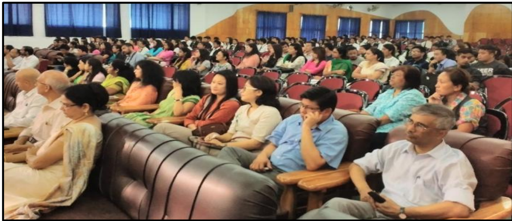
Two days legal awareness programme organized by the Department of Political Science in collaboration with Sikkim State Commission for Women and Sikkim Manipal University in Nov. 2016