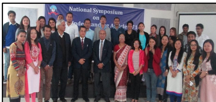
National Symposium on Sikkim: Understanding Article 371 F organized by Department of Political Science