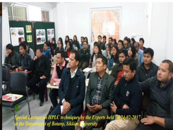
Special lecture on HPLC techniques by the Experts held on 24th Feb. 2017 at Department of Botany